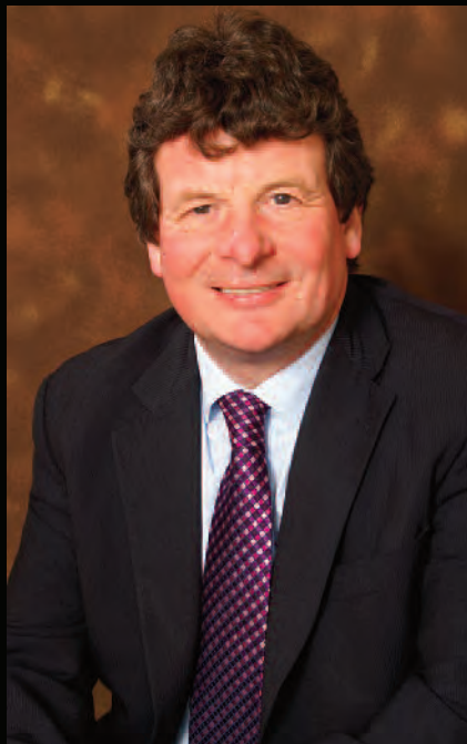
Hon D Cretney MHK, Minister for Community Culture and Leisure

Hon. D Cretney, MHK Minister for Community, Culture and Leisure